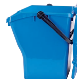
Fully opened lid requires no extra space when against a wall