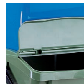
Double hinged front flap on the lid allows filling when containers are stacked