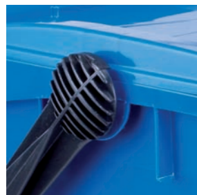
Pivot and handle with automatic locking mechanism

Urba Plus is a space-saving stackable container for the home or office, for pre-sorting wastes. More waste resources can be segregated at source, to improve the recycling rate and the quality of the material recovered. Urba Plus bins can be stacked two or three high in a stable tower, in the space of one. Filling is easy with the lid flap, utilising the full capacity of each container, without the need to move the bins.