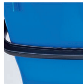
Robust handle with secure grip for working with gloves